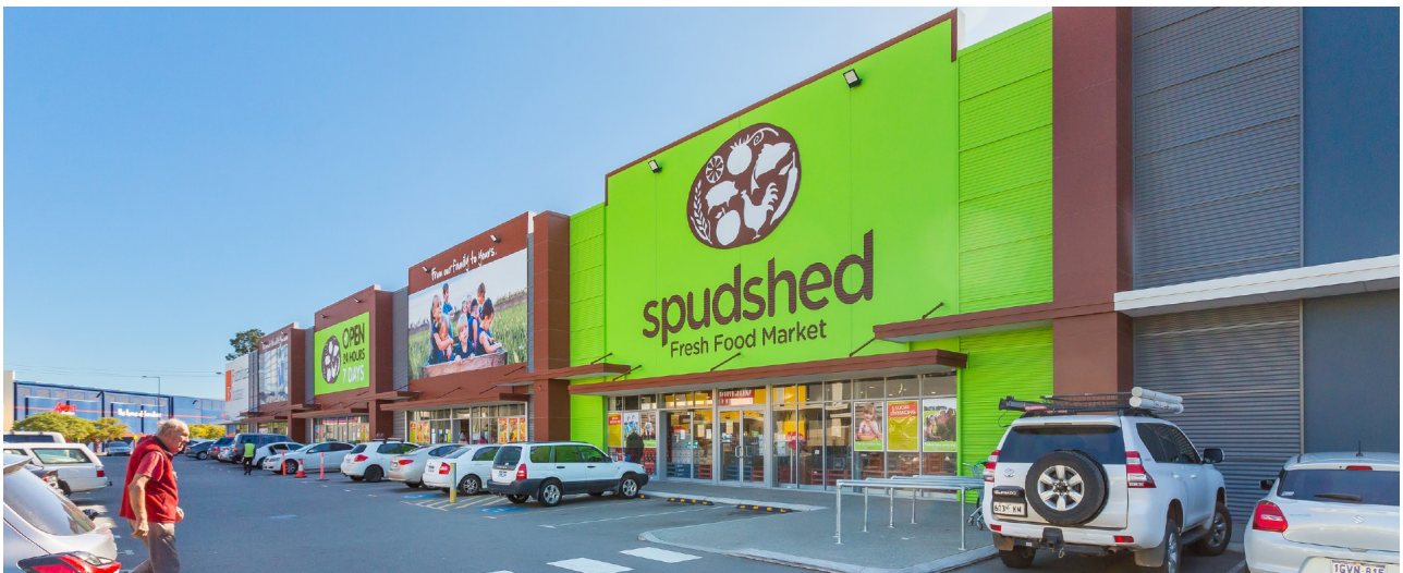
Midland Gate Shopping Centre